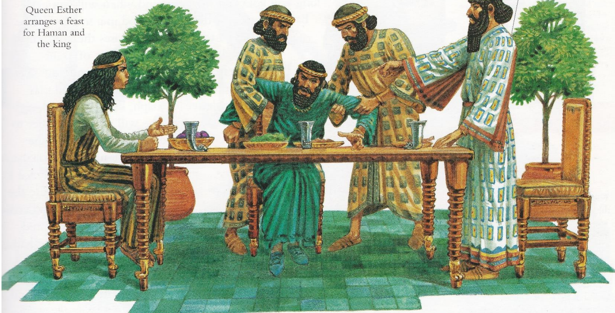
Queen Esther arranges a feast for Haman and the king