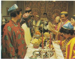
THE FESTIVAL OF PURIM Every year, Jews celebrate Purim to commemorate the events in this story. It is a joyful, noisy occasion, during which the Book of Esther is read out loud.