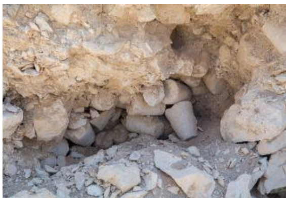
1. A manmade cave filled with partially-completed chalkstone vessels was recently unearthed in Galilee. The ancient vessel factory dates to about 2,000 years ago.

If anything unclean touched a clay jar the contents had to be thrown away and the jar smashed. For example, the Law stipulated that if an unclean animal such as a gecko died and fell in a clay pot, it was to be broken. 3